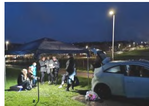
Detached Youth Work at the skate-park

aware, Street Level started out, over 25 years ago, as a Detached Youth Work project. We didn't have a nice, warm, purpose-designed building to carry out our work in. We met the young